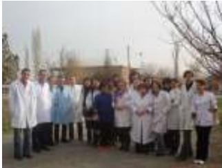
ACMA team in one of the villages