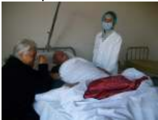
Post operative nurse

“Almost all patients hear the word of God and the Saviour’s message.”